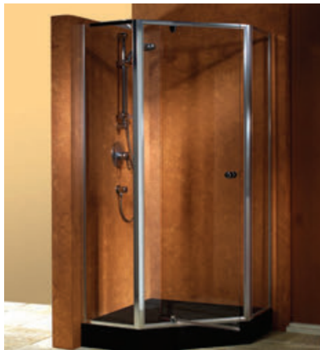
Over 180° of door swing is possible, enabling both inward and outward opening if required, providing maximum use of bathroom area.

Utilising a stainless steel pivot pin, the VISION 2030™ Shower Screen System features a 'positive close' low friction design mechanism, providing the benefit of whisper-quiet and trouble free operation. The 'lowering' effect of the design automatically reduces the gap between door and sill on door closure, which further assists with the minimisation of external splashing and improved water resistance.