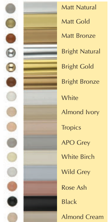
Special colours available on request.

Obligation-free measure and quote Please call for an obligation-free measure and quote, and also ask for details on matching: